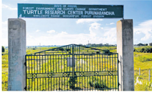
Apart from stone laying, an entrance gate, and barbed-wire fencing, no significant development has occurred on the site

pected to include a research hub for PhD scholars, a state-of-the-art museum, and comprehensive resources on the turtles' life cycle, habitat, and conservation. The centre is also intended to serve as an educational site for tourists, students, and researchers.